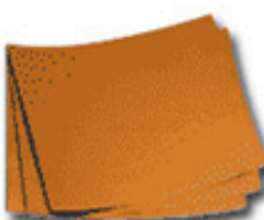
Mono or Multilayer CVDGraphene™ Cu Foil

Stop by our Booth#C40 at the ChinaNano show from Sept 7 th - Sept 9 th to discuss your Turn-Key Nanomaterial R&D Process/ Equipment Solutions!