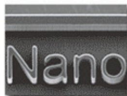
Highly Vertically Aligned CNT